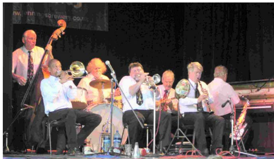
New Orleans Heat with Lucien Barbarin at Keswick Jazz Festival