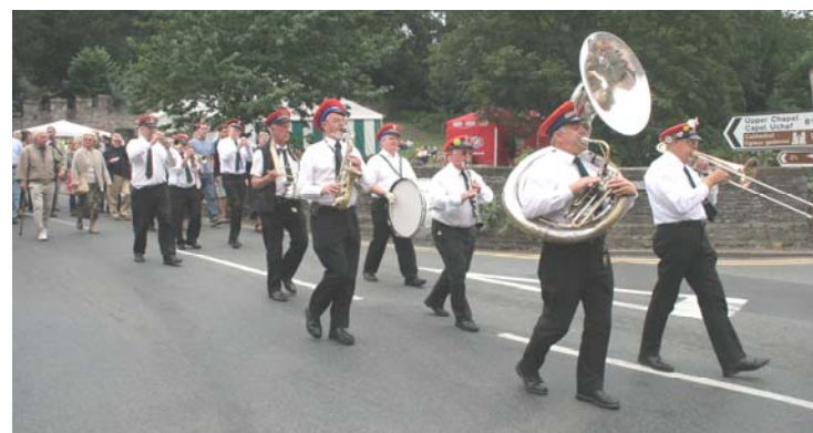
The Adamant at Brecon