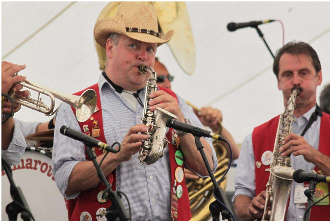
Popular Dutch Parade Band Lamarotte Page 6

Visit the PJS Website :- www.pjscardiff.co.uk