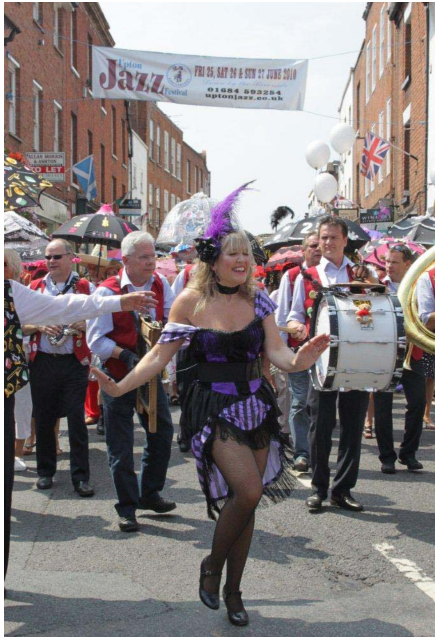
A scene for this years Carnival Parade at Upton upon Severn