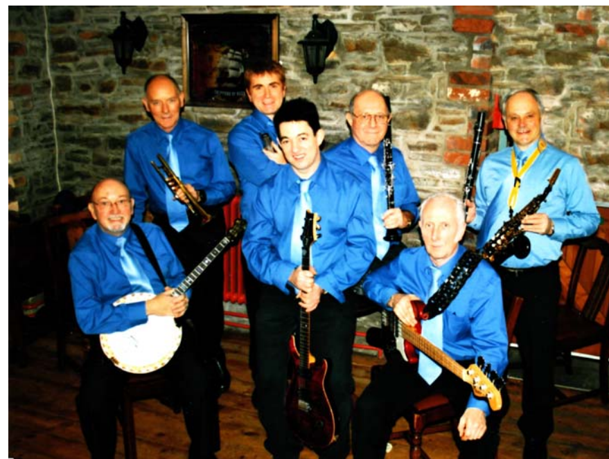
The Workhouse Band 6 th May – Café Jazz