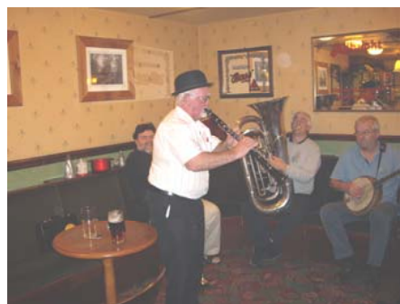
Guess what I'm playing